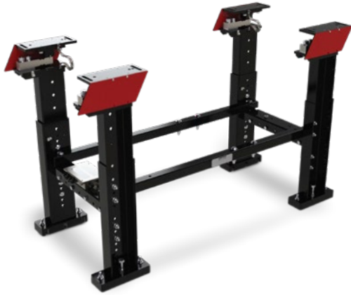
ELS SERIES ELEVATED LOAD CELL STANDS

ELS Series elevated load cell stands can replace existing legs on a conveyor to convert it into a scale. ELS Series weigh stands integrate into pre-existing systems to fit the exact height and width of conveyors from a wide range of manufacturers.