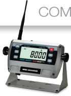
MSI-8000 HD RF Remote Display