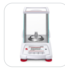
Available for ExCal and InCal