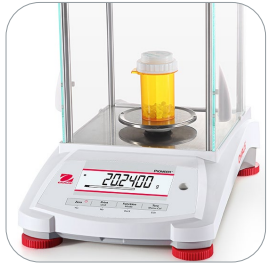
Basic Weighing Application