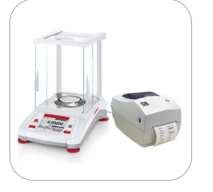
Label Printing Function