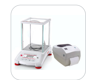
Label Printing Function