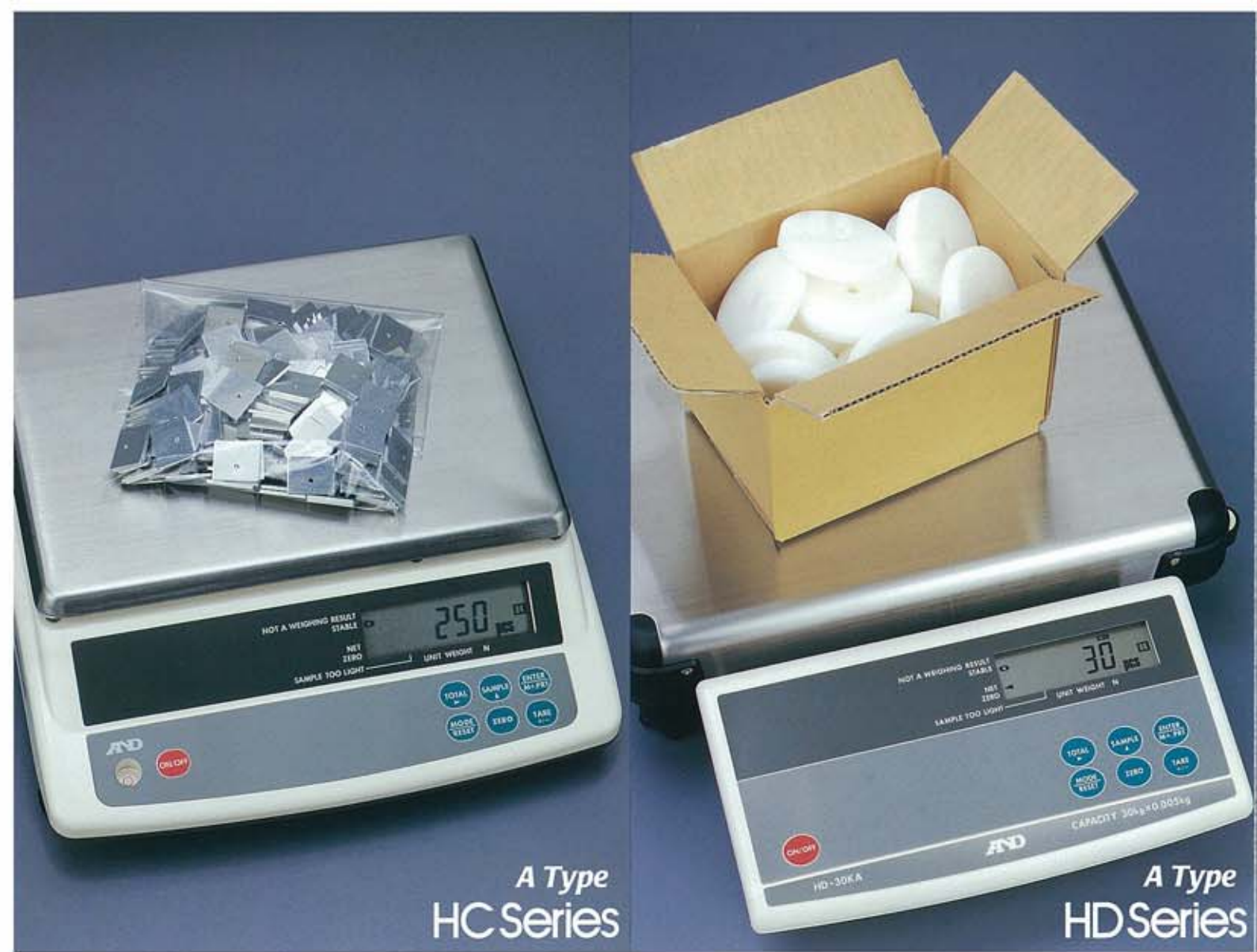
A Type HC Series