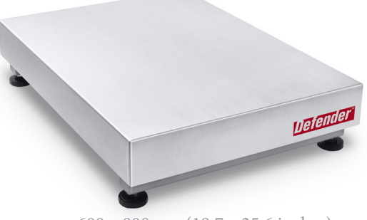
12 x 14 inches) 420 x 550mm (16.5 x 21.7 inches)