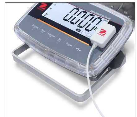
Optional IR RS232 kit for i-D61PW model