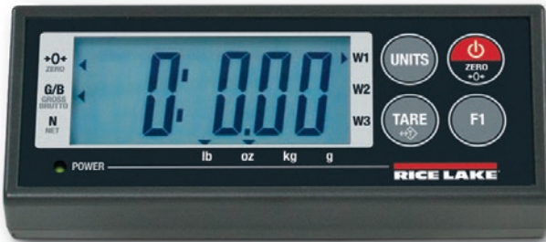
Large 1 inch backlight setting

The BenchPro BP-P digital postal scale is designed to streamline your company's mailing services. Time spent traveling to and from the local post office and waiting in long lines can be costly. Risking returns or spending extra money for postage due to estimates can also hurt the bottom line. Instead of estimating, install a BenchPro BP-P connected directly to the USPS or Canada Post within your company and get a step ahead.