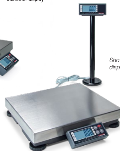
Shown with mounted display option