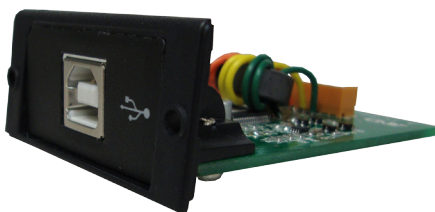
Quick USB interface. Option EJ-02C includes USB cable.