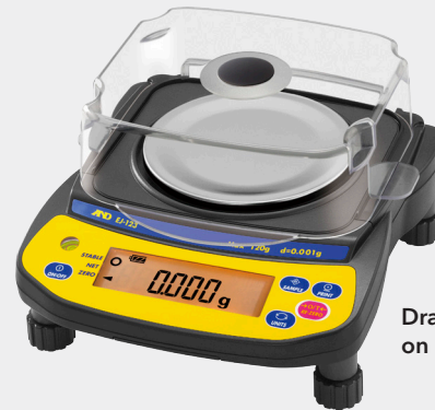
Draft shield standard on EJ-123 and EJ-303

The EJ-303 and EJ-123 make milligram measurements as easy as, well, 1-2-3: