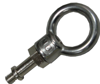
Underhook for 0.1 g models. See Options on page 4.