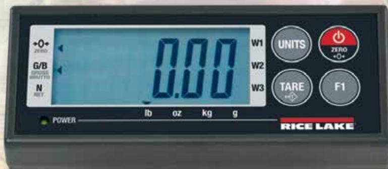
Large 1 inch configurable backlight setting