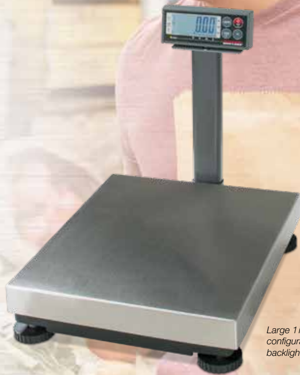
Large 1 inch configurable backlight setting