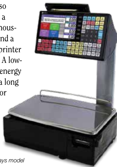
Elevated keyboard and displays model

The Uni-5 is more than just attractively priced. It's also attractive in design, with a polished, black polymer housing that's easy to clean, and a convenient side-loading printer for quick label changing. A low-profile design and green energy consumption round out a long list of essential features for today's progressive retail marketplace.