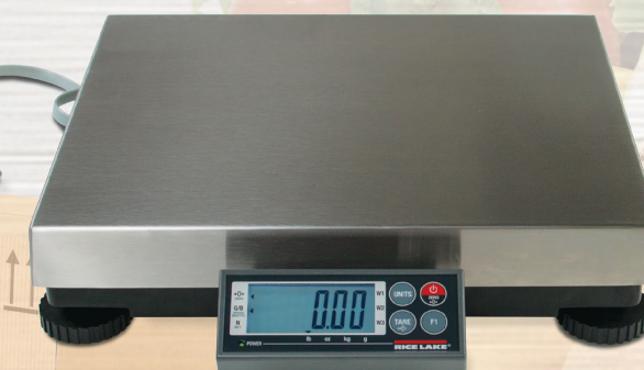
Model BP 1214 with remote display