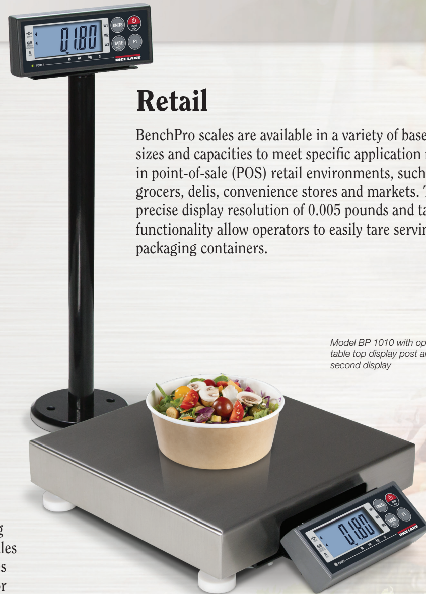
Model BP 1010 with optional table top display post and second display

BenchPro scales are available in a variety of base sizes and capacities to meet specific application needs in point-of-sale (POS) retail environments, such as grocers, delis, convenience stores and markets. The precise display resolution of 0.005 pounds and tare functionality allow operators to easily tare serving and packaging containers.