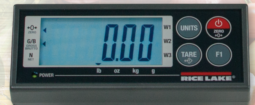
Large 1 in configurable backlight setting

BenchPro scales can be equipped with an additional post mount or table top display to allow both the customer and operator to easily view weight at the time of transaction. The scratch-resistant, tempered glass display keypad provides drop resistance and also repels water, dust and oil for lifetime durability.