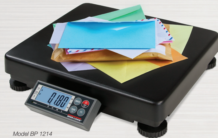
Model BP 1214 with plastic shroud

The multi-range and multi-interval BenchPro scale is ideal for postal applications. From small, lightweight envelopes to larger packages, BenchPro postal scales accurately weigh each package while easily integrating into a small mailroom.